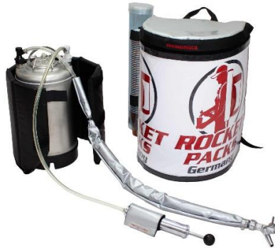
Illustration: Product features for carbonated beverages