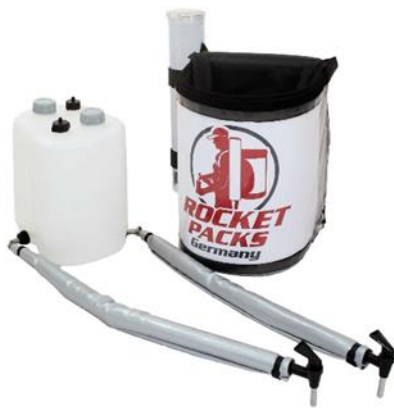
Illustration: Product features for none carbonated beverages

Beverage backpack with insulation (up to 1-2 hours). For serving two types of products from a backpack. Preferably suitable for cold drinks. Gravity-Fed operation of none-carbonated beverages, not need to use additional pressure equipment. Dispensing of carbonated beverages, additional pressure equipment has to be operated. The Mechanical Air Pump with T-Coupler is the most suitable method for this purpose. Ideal for fast beverage service!