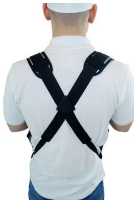
Ergonomic shoulder strap system with adjustable shoulder pad

Particularly suitable for use with 500 ml cans & bottles!