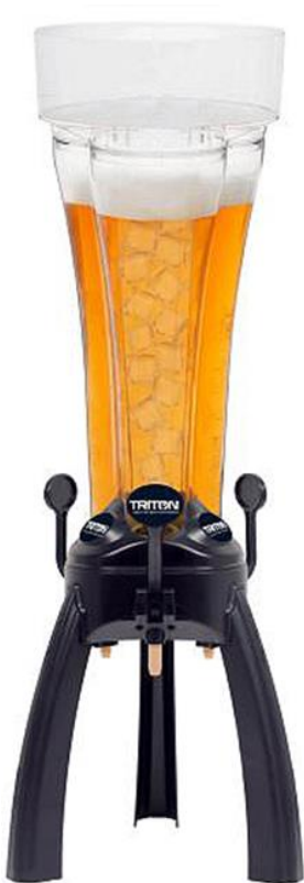
SKY 5 Liter incl. Ice Tube for ice cubes

The materials and raw materials used comply with Regulation (EU) No. 10/2011 and Regulation (EU) No. 1935/2004 and are suitable for use with food/beverages!