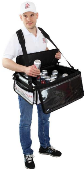
Flexible change of advertising

High capacity Vendor's Tray, thermo-insulated, for a wide range of applications. High-quality materials and workmanship ensure stability and durability. Removable lift-up lid, shoulder belt system with adjustable shoulder pad in the back crosswise, ensure highest wearing comfort. With two side pockets outside for service accessories or money pouch. Front and lid (inside) can be decorated for advertising purposes. When use the Tray with lid also suitable for distribution of ice cream products!