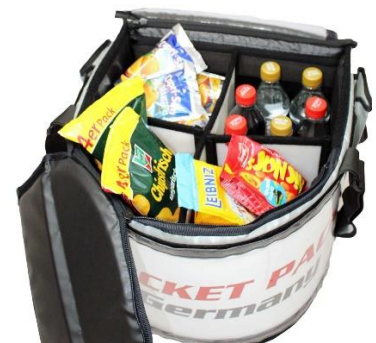
Inlay (room divider), keeps the Tray tidy