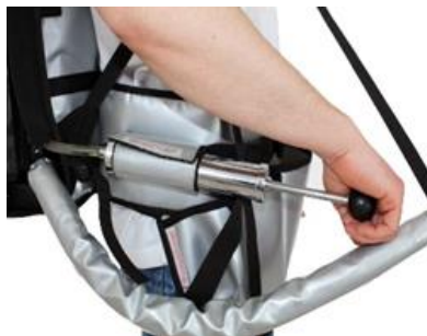
Hand operated Air Pump as pressure equipment

*Further pressure accessories on request*