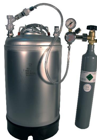
Item RP1102GN & Soda Club CO2-Cylinder attached to 11-liter container