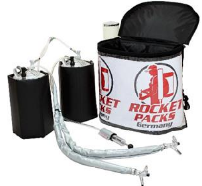
Illustration: Product features for carbonated beverages