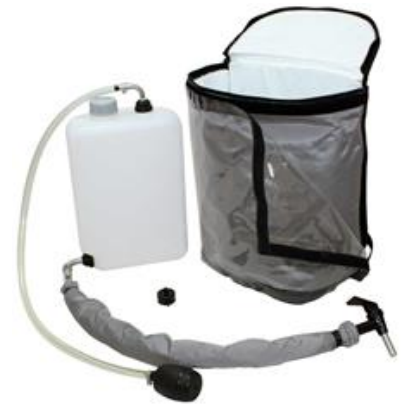
Illustration: Product features for carbonated beverages