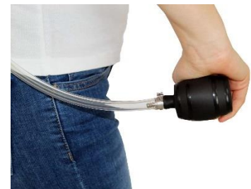
Operation with Mini-Air-Pump as pressure equipment