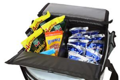
Inlay (room divider), keeps the Tray tidy