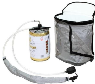
Scope of supply: Party-Pack for 5-liters ALU Beer Can