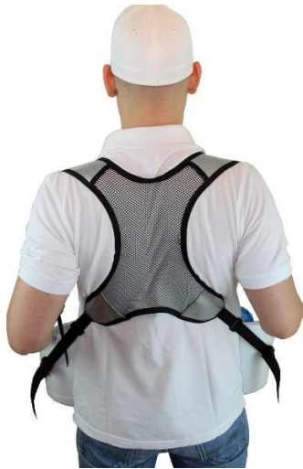
Ergonomical 4-point shoulder strap

Ideal for Ice-Cream and frozen products!