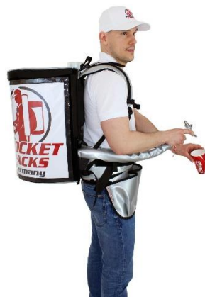
Pro 11-Liter, insures a professional brand appearance