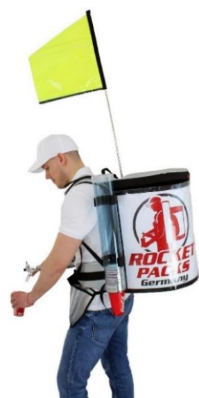
Promo-Flag on Pro 11-Liter