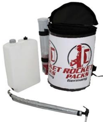
Illustration: Product features for non-carbonated beverages