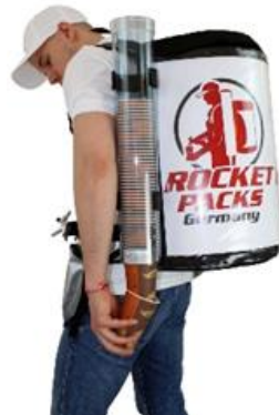
Cup Dispenser for disposable cups 120-300 ml