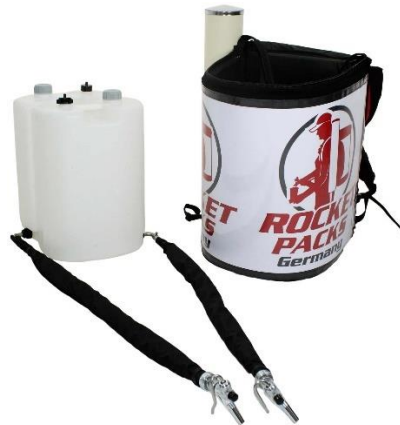
Illustration: Product features for non-carbonated beverages