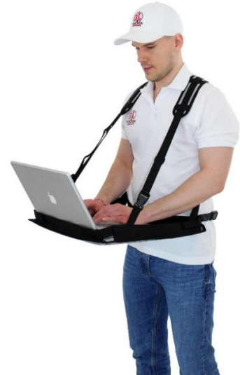
Belt System XL Model