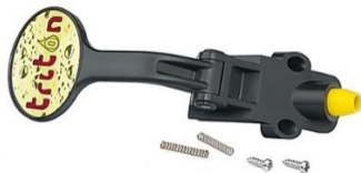
Tap with screws