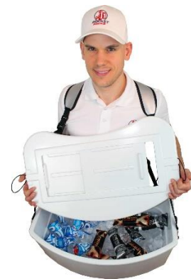
Sliding lid removeable