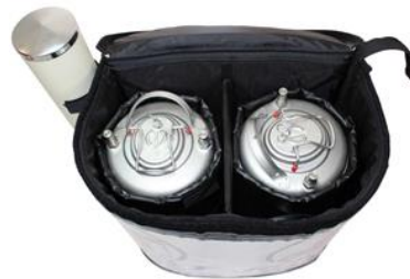
2 separately insulated beverage containers 11-liter