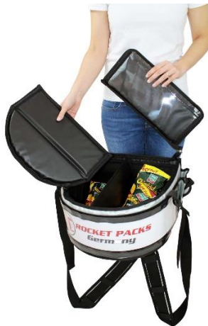
Lift-up lid completely removeable