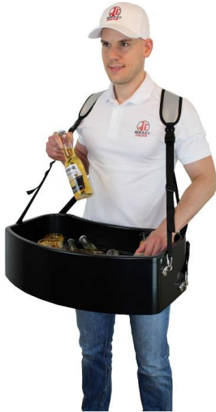
Illustration excl. Foil-Bag

- Flexible applicable Vendor Tray made of all-plastic -