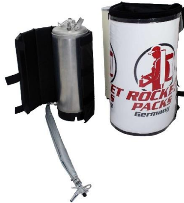
Illustration: Product features for none-carbonated beverages