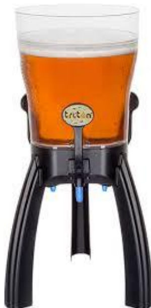
TRITON Promo 5 Liter