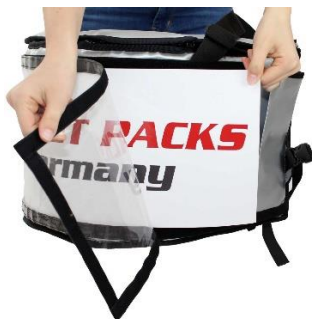
Flexible change of advertising messages