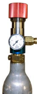
Item RP1102GN CO2-Regulator for Soda-Club bottle (Aluminum)