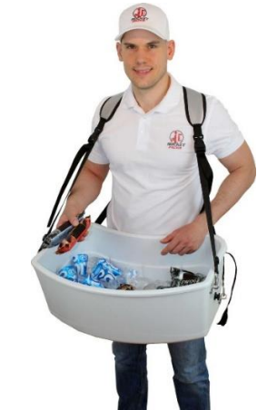
Ice-Cream-Tray excl. Foil-bag and sliding lid