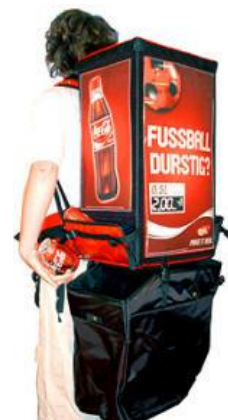
Twin-Pack incl. Waste Bag