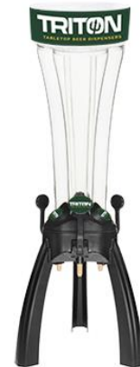
Cooling Block (optional cooling element)