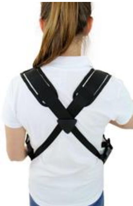
Ergonomic shoulder strap system with adjustable shoulder pad

Insulated Vendor’s Tray is suitable for a wide range of applications. High-quality materials and workmanship ensure stability and durability. Removable lift-up lid, shoulder belt system with adjustable shoulder pad in the back crosswise, ensure highest wearing comfort. With two side pockets outside for service accessories or money pouch. Front and lid (inside) can be decorated advertising purpose. When used the Tray with lid also suitable for distribution of ice cream products!