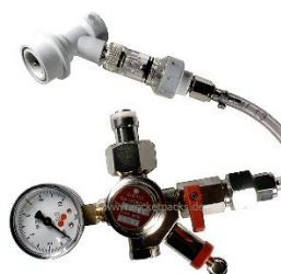
Item RP1102GN CO2-Regulator for Soda-Club bottle (Aluminum)