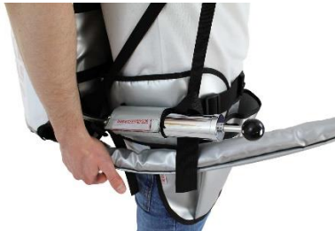
Hand operated Air Pump attached to backpack harness