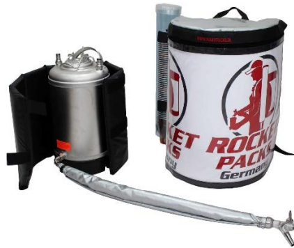
Illustration: Product features for non-carbonated beverages