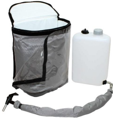
Illustration: Product features for none-carbonated beverages

Simple beverage backpack, with moderate insulation, suitable for any fun occasion. Preferably suitable for cold drinks. For still drinks, the emptying is working through Gravity-Fed - no additional pressure accessories required. When use the backpack with carbonated beverages, the Mini-Air-Pump has to be operated as pressure accessory.