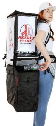
Twin-Pack incl. Waste Bag