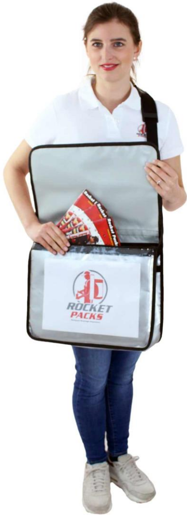
Inside-View Promotion Bag

Functional, many sided applicable Shoulder-Bag, made of durable truck tarpaulin with comfortable shoulder belt, adjustable and padded. Individually promotional decorations with paper inserts on the front and cover on the outside.