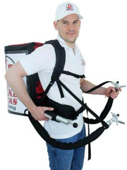
Light weight backpack High load capacity

By using the air pump also suitable for CO2 operation!