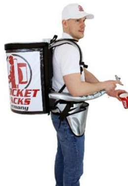
Pro 11-Liter, insures a professional brand appearance