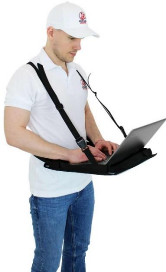
Belt System Standard Model