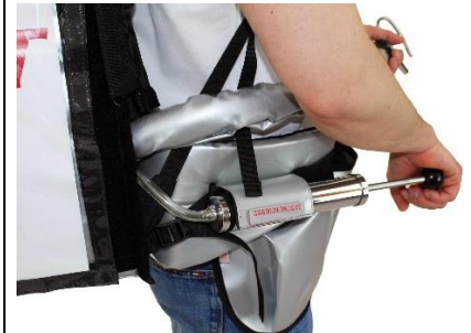
Pump connected to article Premium 11-Liter