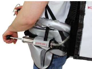
Hand operated Air Pump as pressure equipment

*Further pressure accessories on request*