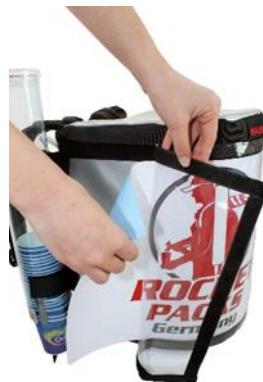
Flexible advertising decoration by paper insert behind foil