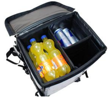
2 chamber device with loading capacity for 15 cans or bottles up to 500 ml each