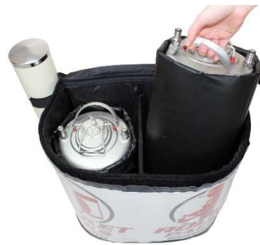
2 separately insulated beverage containers 11-liter