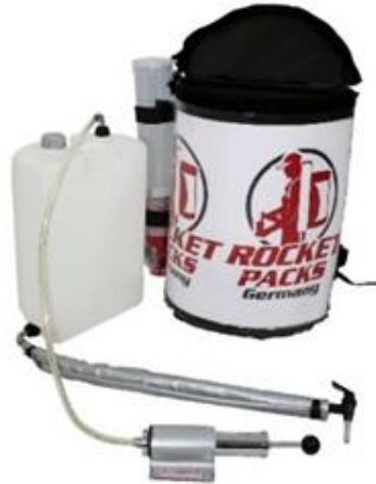
Illustration: Product features for non-carbonated beverages