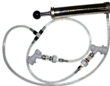
Air-Pump with T-Connector