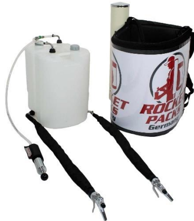
Illustration: Product features for carbonated beverages