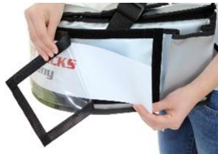
Flexible change of advertising messages

15-hole insert for stabilizing of cans, bottles and cups