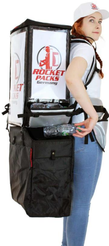
Twin Pack with waste bag for disposal of empty container

The Twin Pack can be converted into a beverage backpack for serving in to cups. Just ask us for solutions and prices.