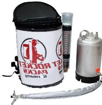
Illustration: Product features for none-carbonated beverages