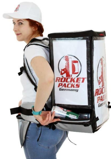
Flexible exchangeable advertising messages!