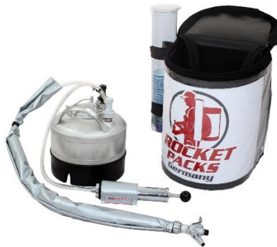
Illustration: Product features for carbonated beverages