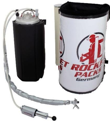
Illustration: Product features for carbonated beverages