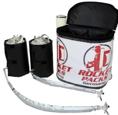
Illustration: Product features for none-carbonated beverages