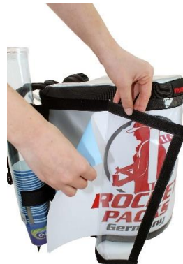
Flexible advertising decoration by paper insert behind foil