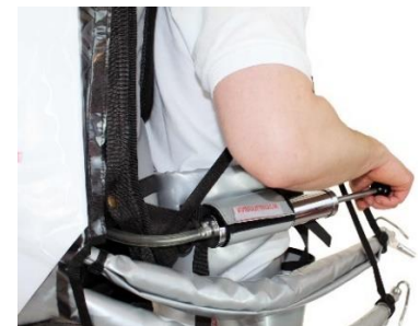
Hand operated Air Pump as pressure equipment