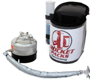
Illustration: Product features for non-carbonated beverages