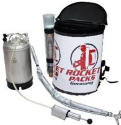
Illustration: Product features for carbonated beverages