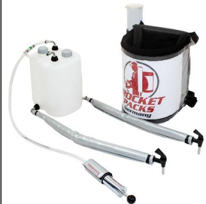
Illustration: Product features for carbonated beverages