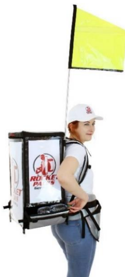
Promo-Flag on Twin-Pack