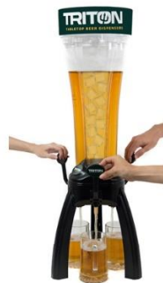
Multi-Tap System Three Dispensing Taps