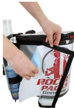
Flexible advertising decoration by paper prints behind foil