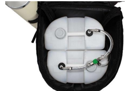
Pump with T-Connector attached to article Kombi 2x 15-Liter